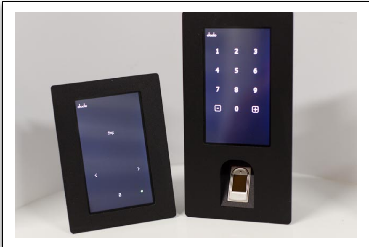
Standard LCD Touch Panel